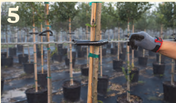
5 Center tree and wrap right side of helix wire (C) around trellis line in a counter-clockwise motion.