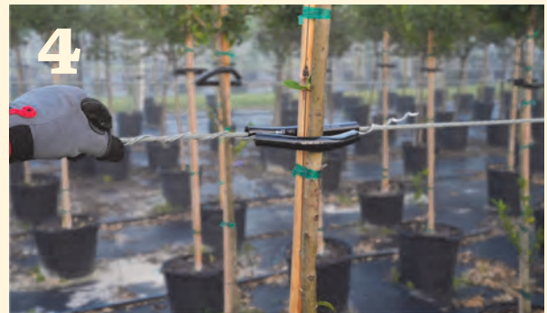
4 Wrap left side of the helix wire (C) around trellis line in a counter-clockwise motion.