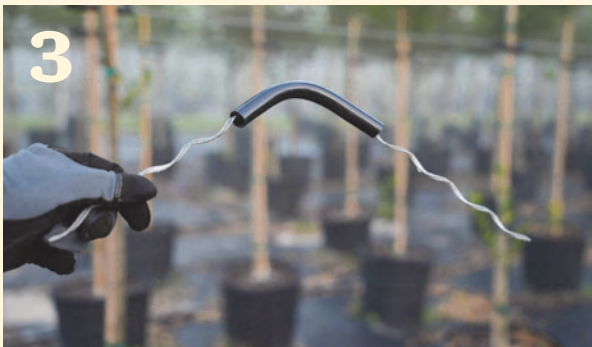
3 Insert the helix wire (C) into unslit tubing (B) until centered. Some straightening of helix wire is necessary to accommodate tree diameter.