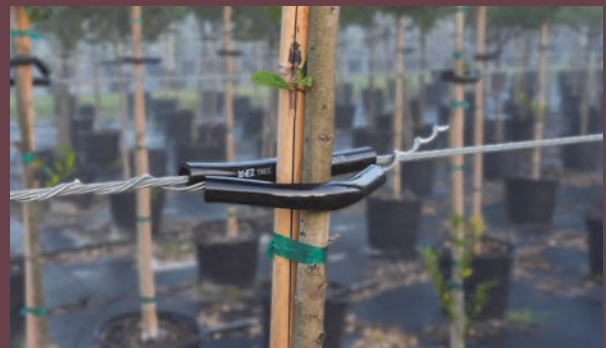
FOR TAKEDOWN: Simply unwrap either side of the helix wire and remove tree.