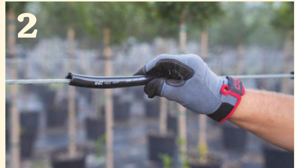
2 Slot the slit tubing (A) onto trellis line at desired installation point. Be sure slit faces away from tree. Center tree on slit tubing.