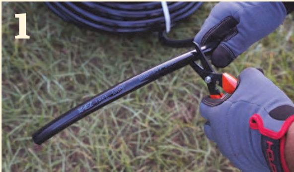
1 Cut tubing (A&B) to desired lengths