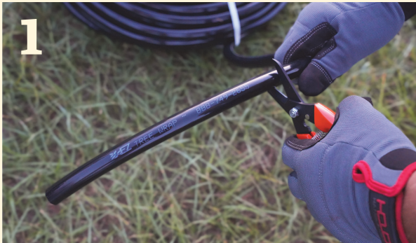
1 Cut tubing (A&B) to desired lengths