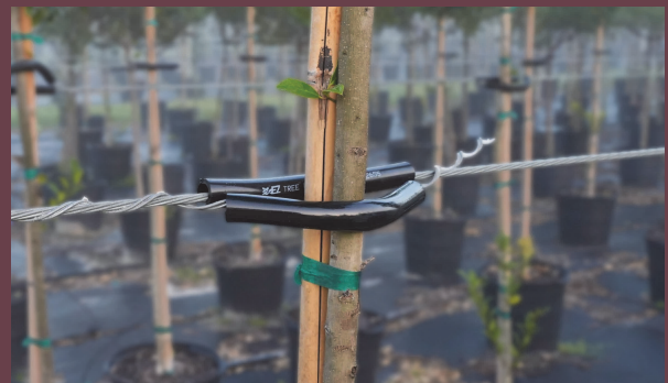
FOR TAKEDOWN: Simply unwrap either side of the helix wire and remove tree.