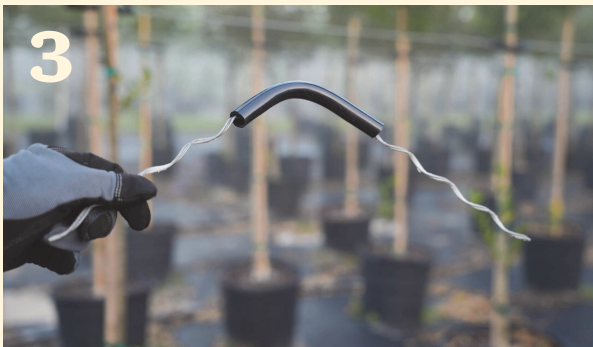
3 Insert the helix wire (C) into unslit tubing (B) until centered. Some straightening of helix wire is necessary to accommodate tree diameter.