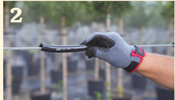
2 Slot the slit tubing (A) onto trellis line at desired installation point. Be sure slit faces away from tree. Center tree on slit tubing.